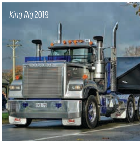
King Rig 2019